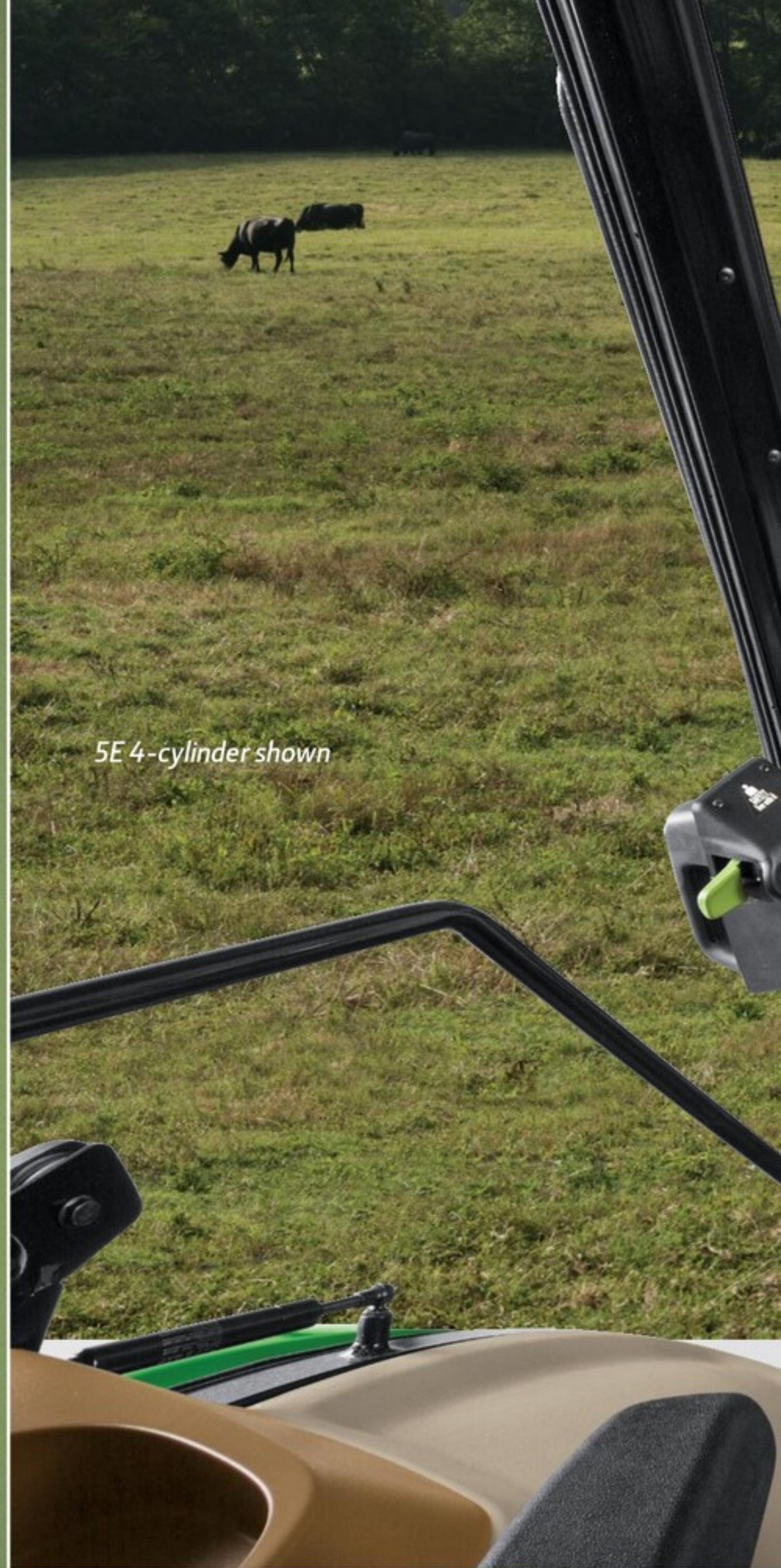
5E 4-cylinder shown

With a back window that opens a full 70 degrees and a fuel tank tucked out of your line of sight, the 5E Series offers superior visibility for quick implement hookup. The operator-friendly cab also features a black out visor to ward off the sun and a bright dome light to help navigate under the stars.