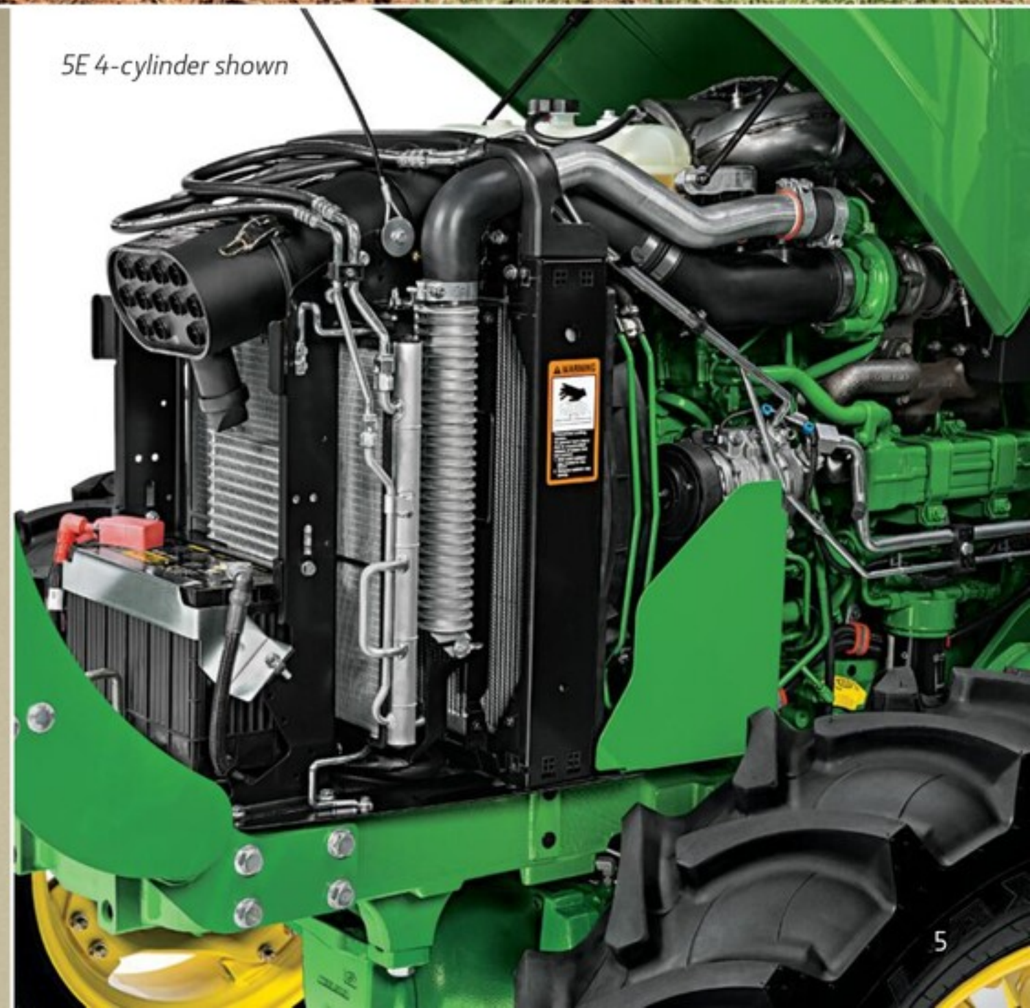
5E 4-cylinder shown

The 5E Series makes using your tractor simple, without sacrificing efficiency or emissions compliance. The engine runs at a standard rated operating speed of just 2100 RPM on the 5E 3-cylinders and 2400 RPM on the 5E 4-cylinders. This helps to significantly reduce noise, vibration and wear over the long run.