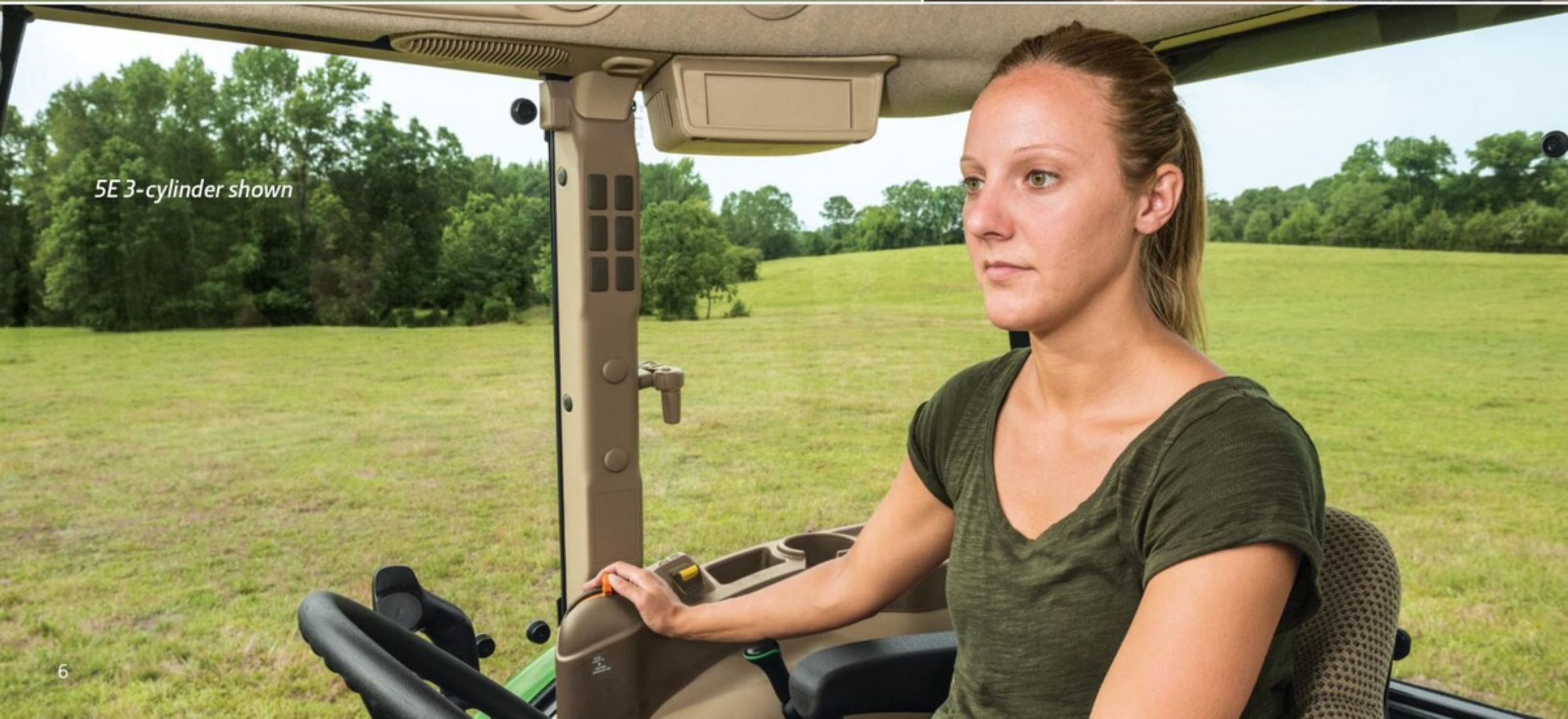
5E 3-cylinder shown