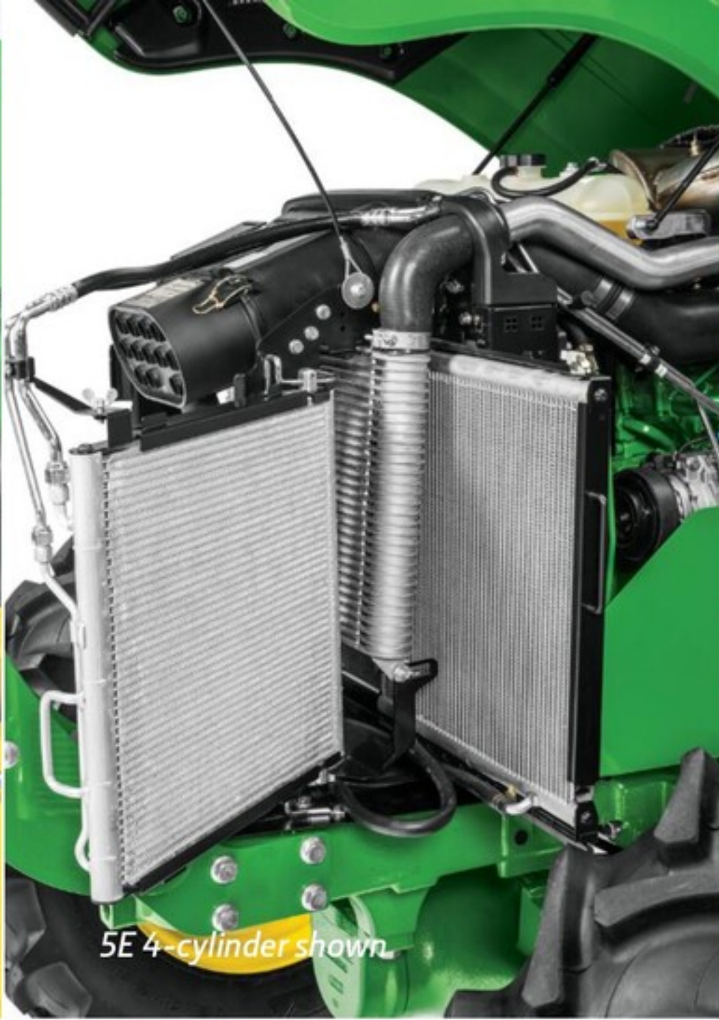
5E 4-cylinder shown