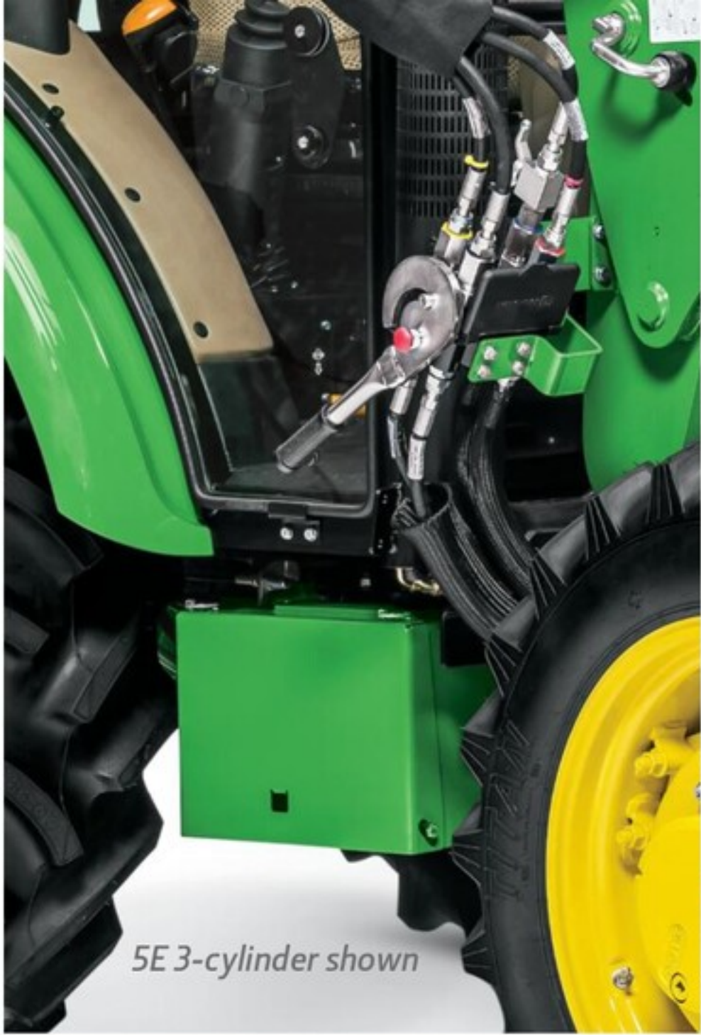
5E 3-cylinder shown